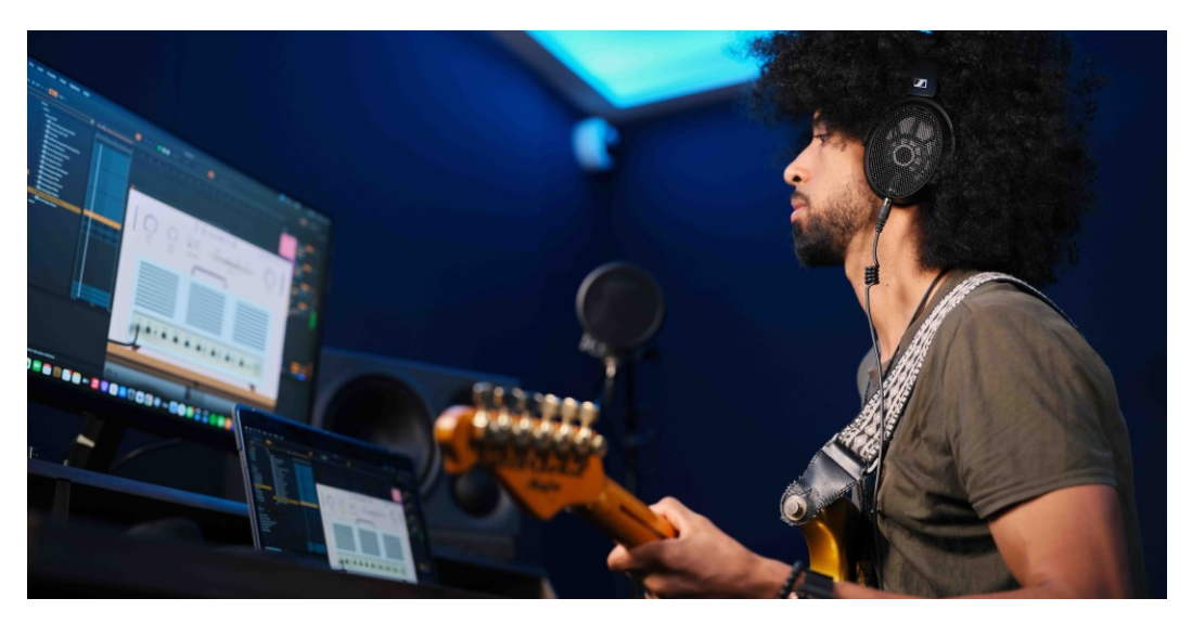
Built to handle the complexities of today's music production

The Sennheiser HD 490 PRO reference studio headphones are the perfect mix of clarity, comfort and reliability