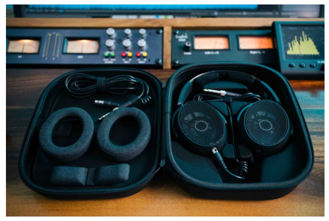
The HD 490 PRO Plus (pictured) includes a case, additional 3 m headphone cable and an extra fabric headband pad

Each HD 490 PRO is delivered complete with two different sets of ear pads (mixing and producing) plus a 1.8 m headphone cable and a dearVR MIX-SE licence. It retails at EUR 399 (MSRP) or USD 399 (MAP). The HD 490 PRO Plus, priced at EUR 479 (MSRP) or USD 479 (MAP), additionally includes a 3 m cable, a transport case, and an extra fabric headband pad in addition to the standard velour headband. All Plus extras are also available as individual accessories. A balanced headphone cable (EUR 39 MSRP, USD 39 MAP) is available as an optional accessory.