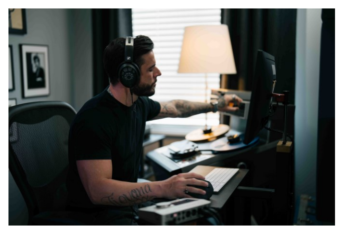
The HD 490 PRO studio headphones deliver a wide, spatial sound stage with excellent localisation, enabling producers to create refined masters

To tackle this complexity, the Sennheiser engineers have given the HD 490 PRO an extremely wide, dimensional sound stage for precisely localising the components of a mix. Ultralight voice coils ensure a fast and authentic sound reproduction. The frequency response is uncoloured and honest across the entire audio spectrum, with the low end being full, accurate, and clearly defined thanks to a special low-frequency cylinder. The open-mesh ear cup covers reveal Sennheiser's Open-frame Architecture, which minimises resonances and distortion. For an optimal listening experience, the transducers sit at a slight angle, thereby emulating a typical monitor loudspeaker set-up.